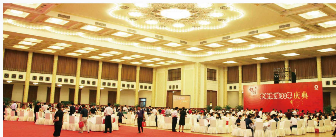
人民大会堂 Great Hall of the People