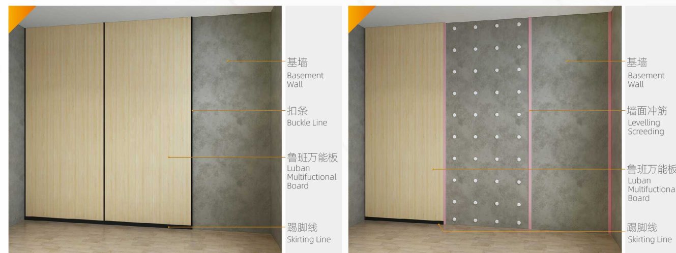
扣条安装 Installation of Buckle Line