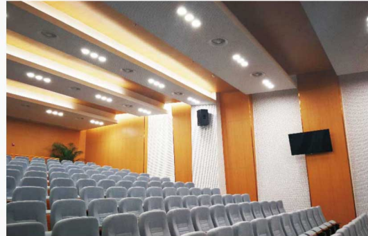
报告厅 Conference Hall