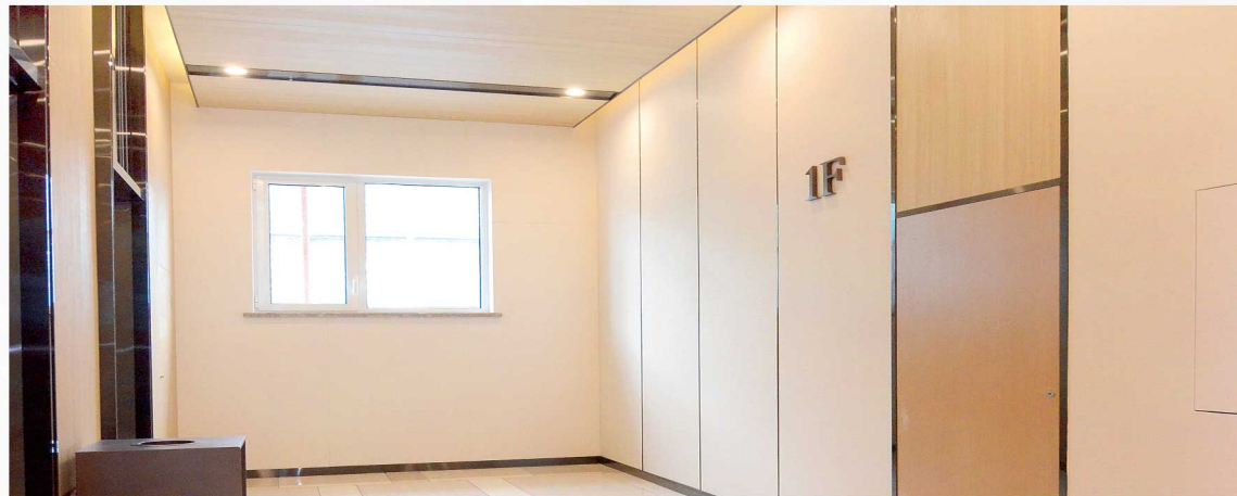
龙湖地产 LONGFOR China