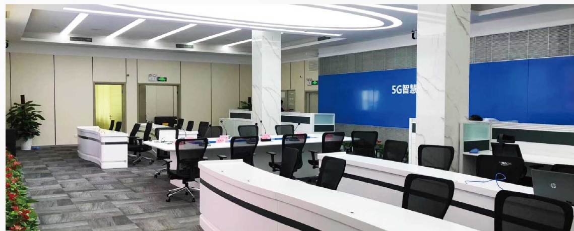
中国石油报社 China National Petroleum News