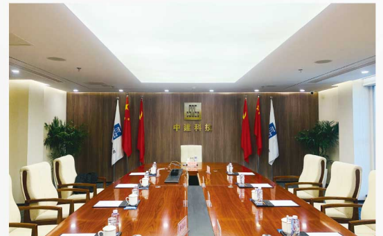
会议室 Meeting Room