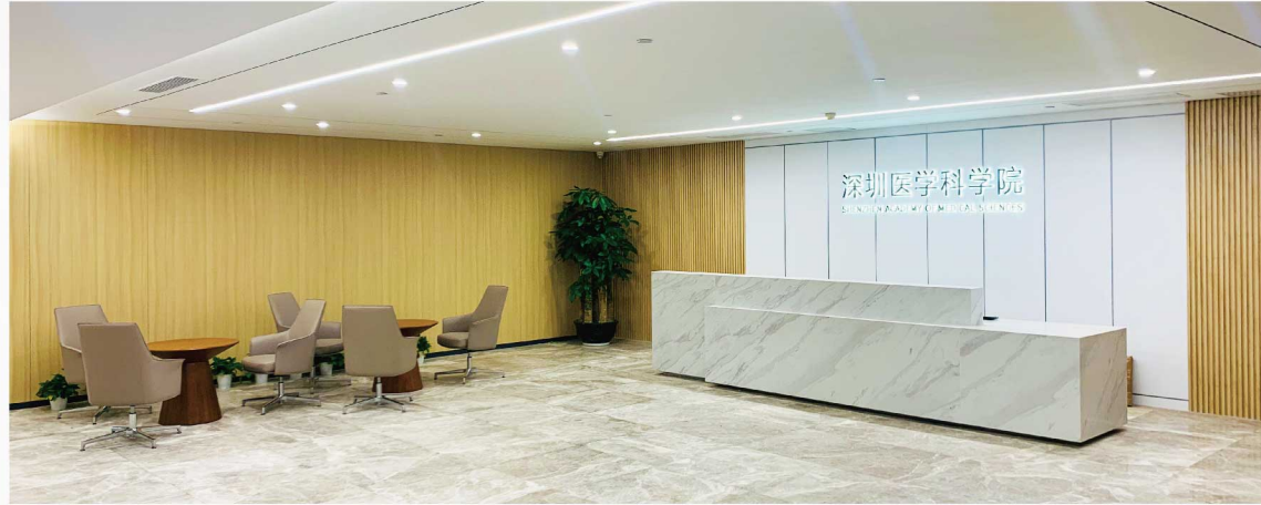
深圳医学科学院 Shenzhen Academy Of Medical Sciences