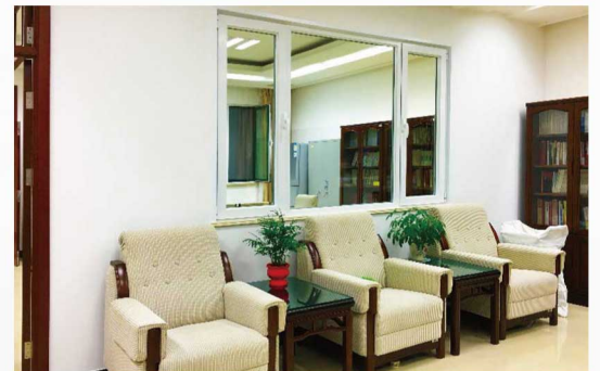
会客室 Reception Room