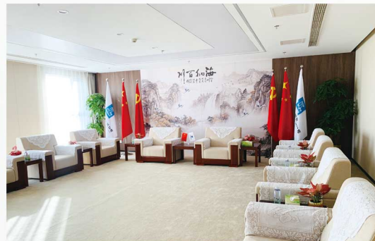
贵宾室 VIP Room